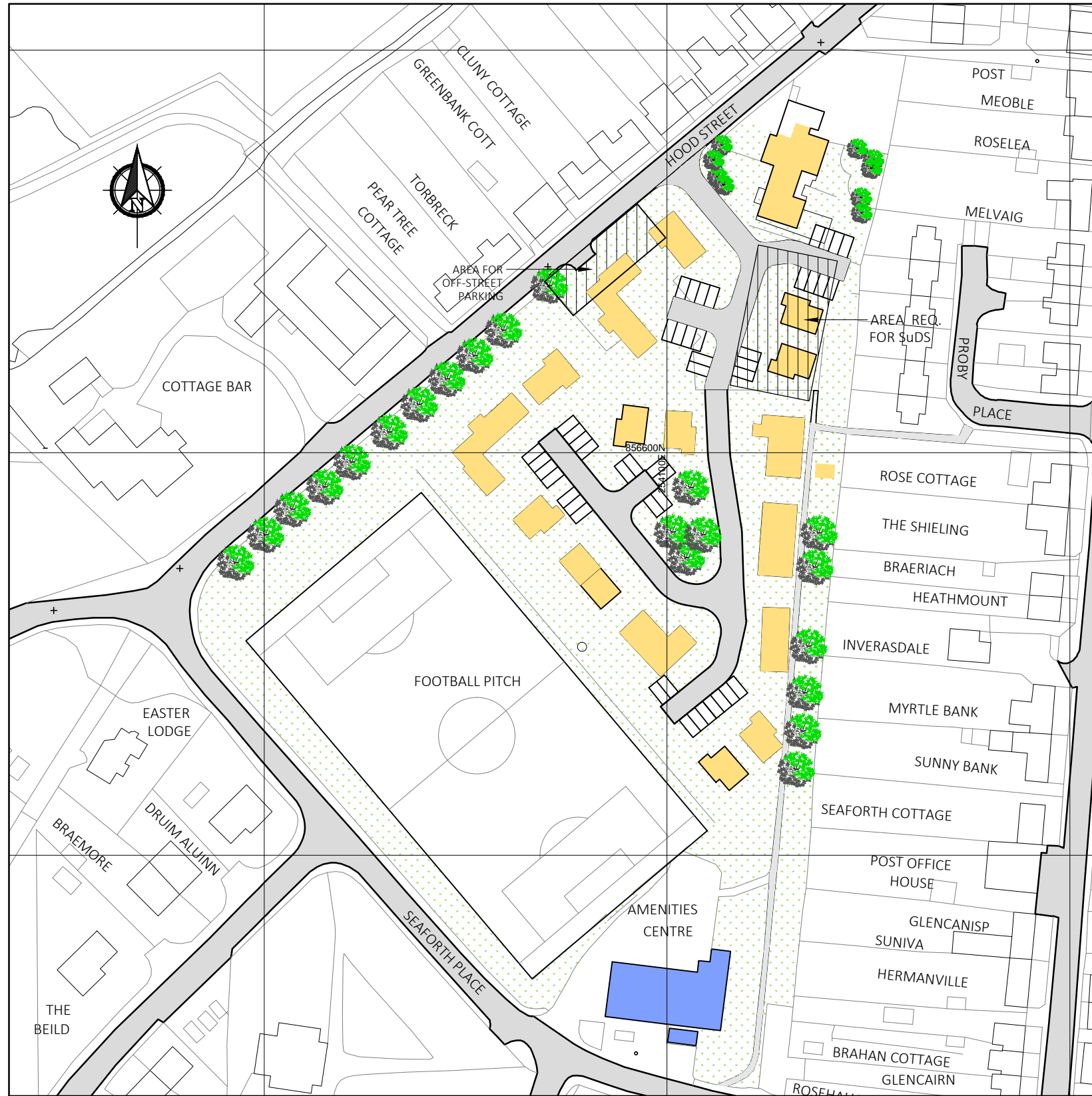
HIGHLAND COUNCIL SUGGESTION FOR OLD SCHOOL SITE & COMMUNITY GREENSPACE SCALE 1:1,250