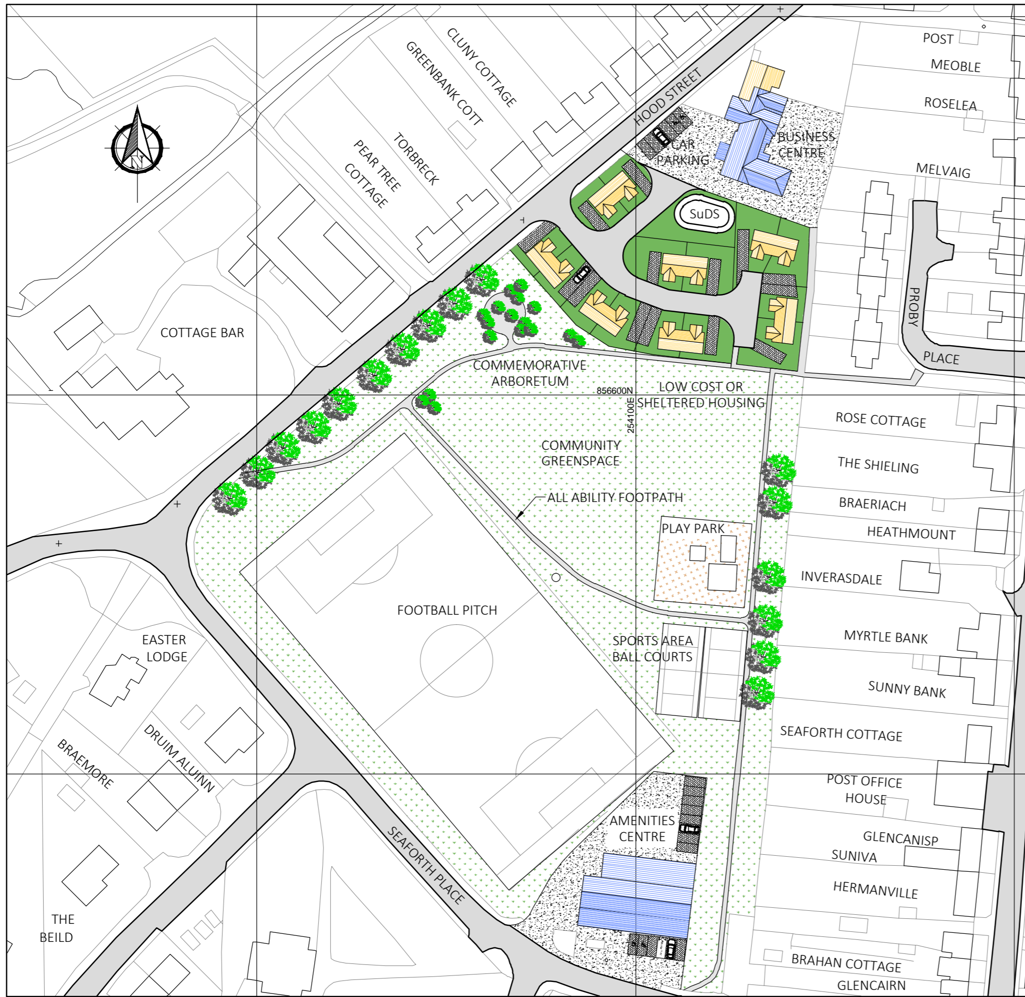
OPTION 5 - AMENITIES CENTRE AND OLD SCHOOL BOTH RENOVATED SCALE 1:1,000