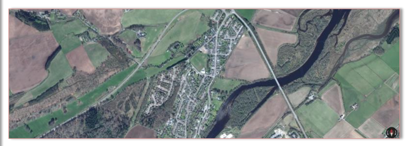
Figure 1 – Maryburgh from above