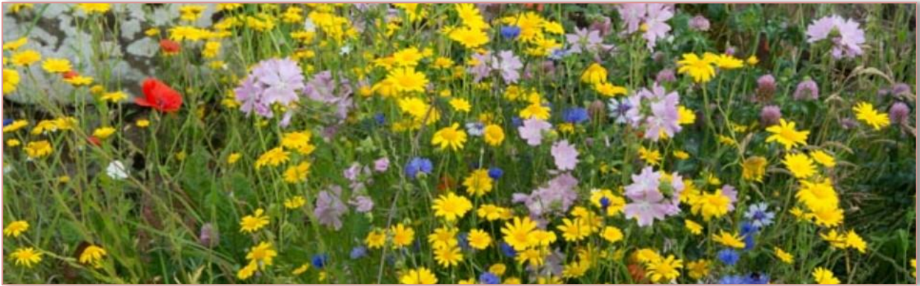
Last splash of summer colour, Maryburgh.

This e-bulletin is the digital newsletter for all members of the Maryburgh Amenities Company Ltd. and is designed to keep all its members informed and updated. News this issue, including progress being made with the Business Plan to obtain support from the Scottish Land fund as well as other grant information and information on the online Hall Booking system which is now active.