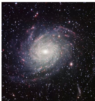
Just a space filler

The information gathered from this feedback will be used in the second draft of the Business Plan. This will help decided on the facilities that the Amenities Centre will provide in the future. This therefore means that it is very important that all the needs of everyone in the village are taken into consideration.